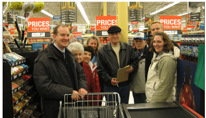
Shopping for the Christmas Food Baskets for Needy